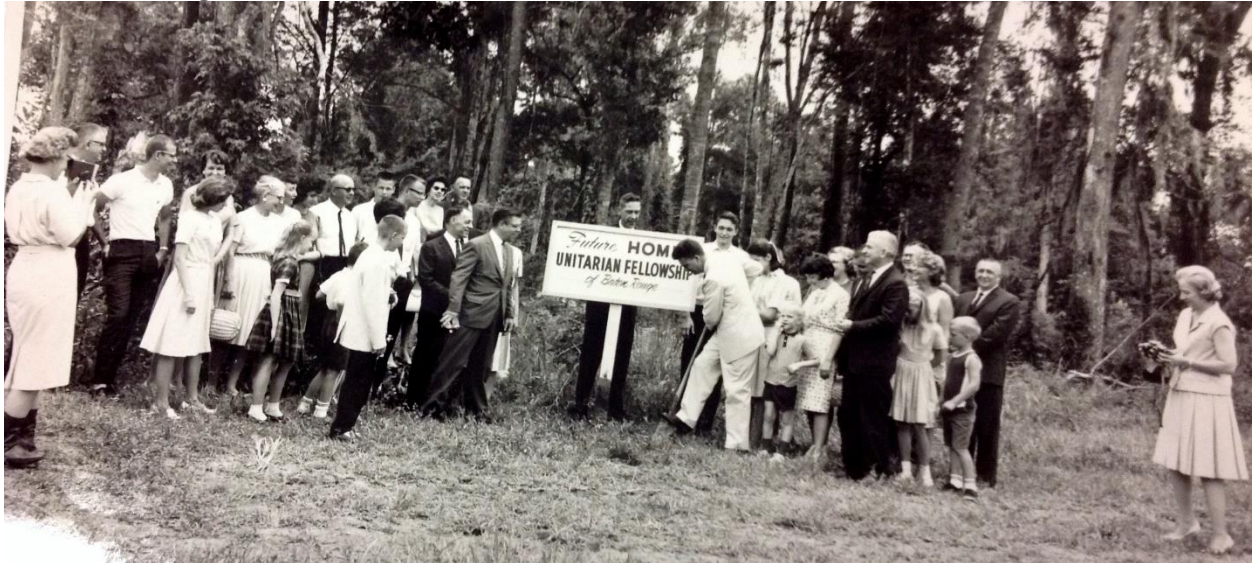
Groundbreaking on Goodwood Blvd.

Deep South city that had not been welcoming to this “strange new radical religion.”